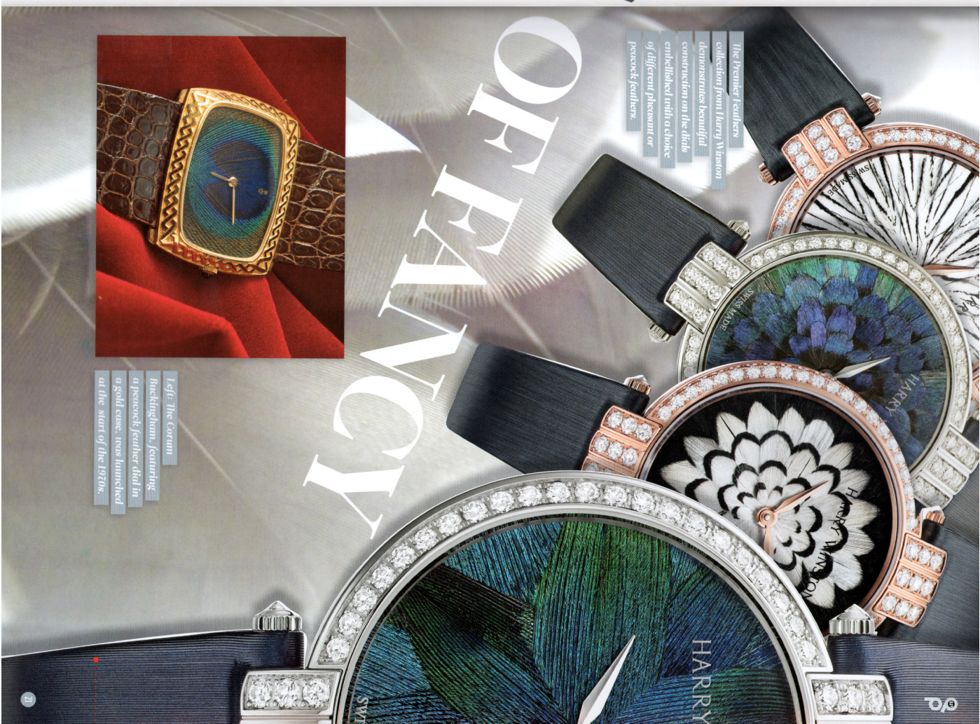
The Premier Feathers collection from Harry Winston demonstrates beautiful construction on the dials embellished with a choice of different pheasant or peacock feathers.

This year's biggest watch fairs saw several familiar brands using 'feather mosaic' on their dials. But as novel as it seems, this is an art that was actually practiced over half a century ago by the Aztecs. Records show that Spanish conquistadors carried a number of objects featuring this craft to Europe, where they ended up in curiosity cabinets or as part of encyclopedic collections of objects that had yet to be categorised in Renaissance Europe. The pieces became prized among Europe's royalty, and today the rare beauty of feather mosaic is once again gracing the most luxurious products. Swooping forward to 1970s horology, Corum introduced a feather watch with a dial comprising a single peacock feather surrounded by a gold TV-screen-style case that allows the full beauty of the bird feather's pattern to be showcased within its frame. Cartier also used single feathers to decorate dials in the 1980s – a nod back to the brand's past when, in the late-1920s, it introduced various clocks designed