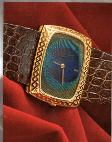
Left: The Corum Buckingham, featuring a peacock feather dial in a gold case, was launched at the start of the 1970s.