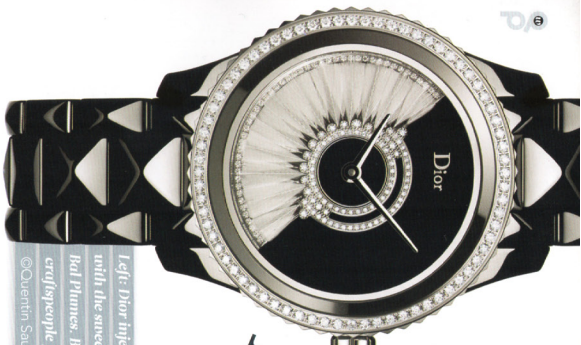
Left: Dior injects a touch of 1920s glamour with the sleeking leathers of the Dior VIII Grand Bal Plumes. Below: Nelly Saunier, one of the few craftspeople practicing plumasserie today.